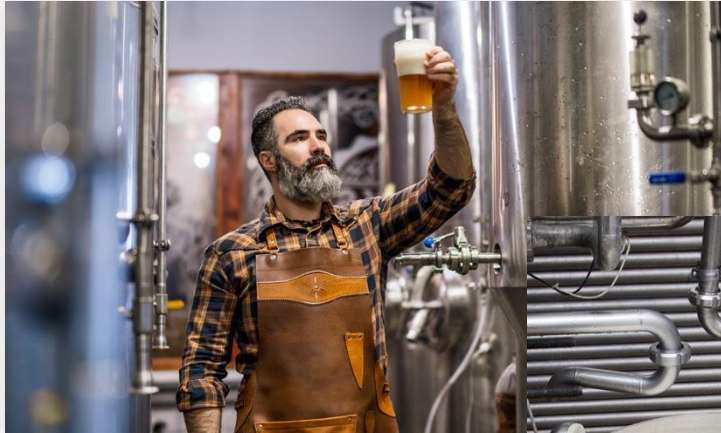
01 Brewery • flexible & efficient conversions and repairs, compliance with high hygiene standards