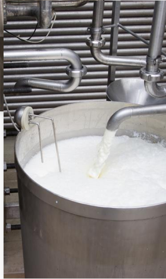
02 Dairy • Establishment of piggable tube systems through high-quality weld seams