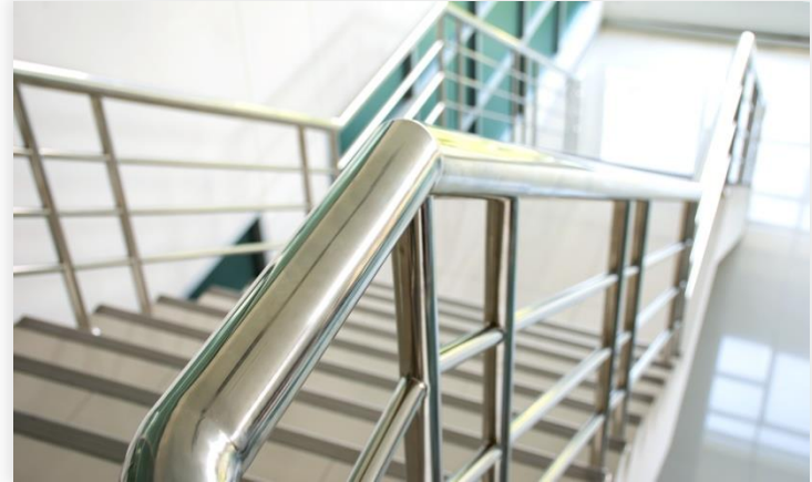
03 Railing construction • aesthetic demands, compliance with safety standards and consistent reproducibility